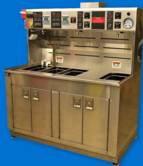
Wet Process Stations